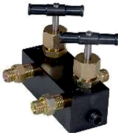
1/2 PDB with Shut-off valve